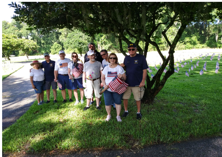
Members of our 4 th Degree Assemblies and their wives.